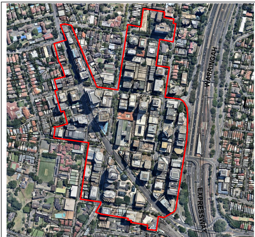
FIGURE 1: Aerial Photograph North Sydney Centre (outlined in red)